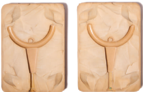
1.2.3. dinh van archives • 4. Taurus large pendant, yellow gold – 3 500€ on Maillon dinh van S chain, yellow gold, 42cm – 1 680€ • 5. Maillon large earrings, yellow gold and diamonds – 7 300€ • 6. Le Figaro archive, Tuesday 26 June 1973.